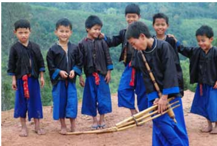
Figure 3. Striped Hmong boys demonstrate their qeej skills at the New Year Festival in Laos.